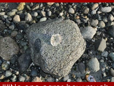
""No one cares how much you know, until they know how much you care" ~Theodore Roosevelt